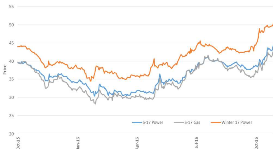
Forward Energy Prices